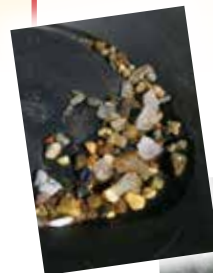
Photo illustrates some of the sluice's contents. Does not represent a guarantee of success.